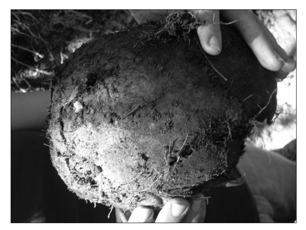
The skull of one of the Irish immigrant railroad workers who died in the 1832 cholera epidemic and was buried in the mass grave at Duffy's Cut. This man, excavated in August, 2009, has a cranium that shows signs of perimortem violence.

the whole community, from which very few individuals are exempt." The specific symptoms of a "predisposition" of the disease are described: